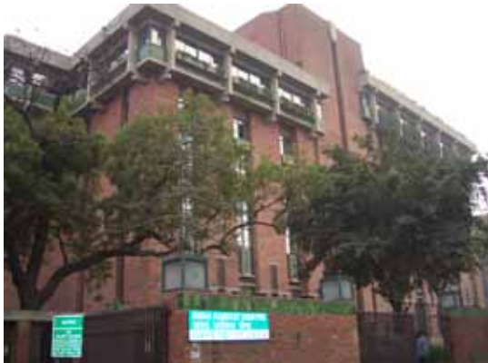
Seminar venue: India Habitat Centre

The Federation of Asian Motorcycle Industries (FAMI), with the assistance of the Society of Indian Automobile Manufacturers (SIAM), on January 16 held the 5 th FAMI Road Safety Seminar in New Delhi, India. The seminar, convened at the India Habitat Centre, was attended by about 100 persons and was a major success.