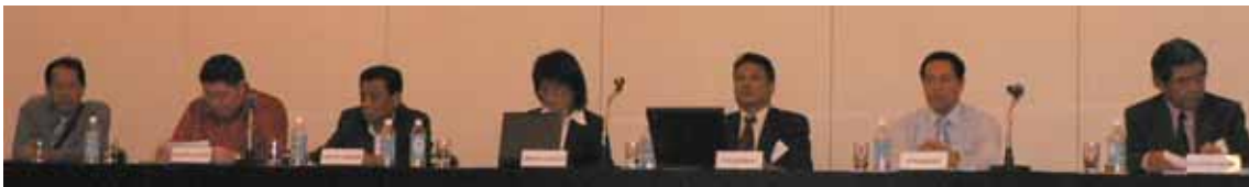
FAMI key persons constituting the Management Committee

Finally, the next FAMI Annual General Meeting and the convening of the Management Committee are scheduled for next March in Indonesia.